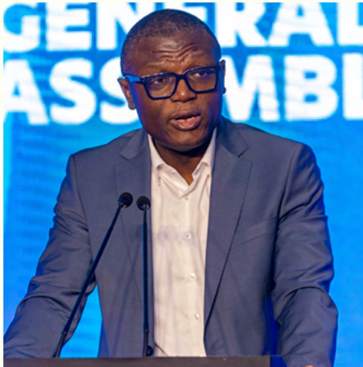
HON KOFI IDDIE ADAMS(MP) MINISTER FOR SPORTS & RECREATION